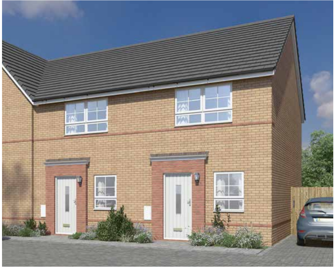
Computer generated image shown.