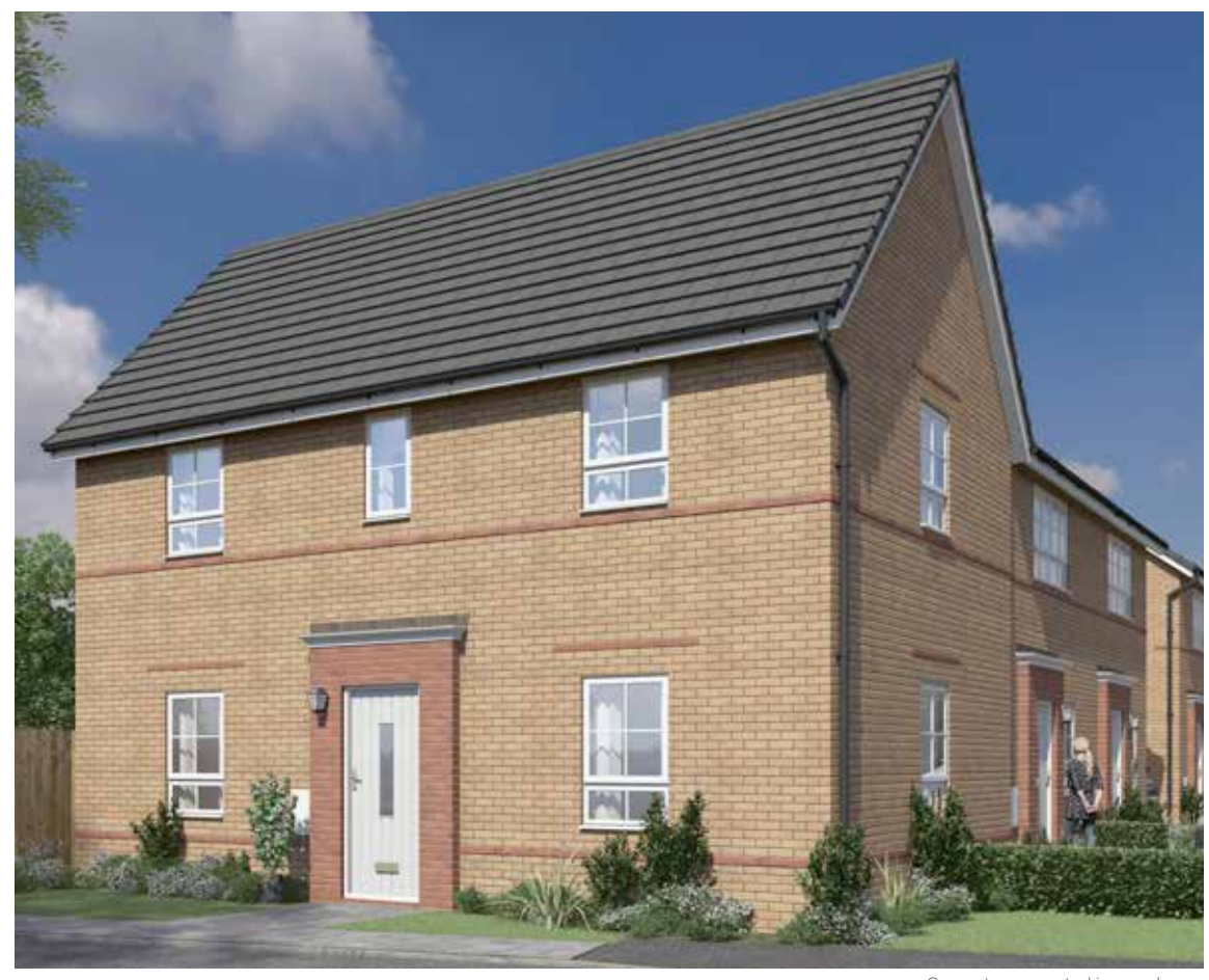
Computer generated image shown.