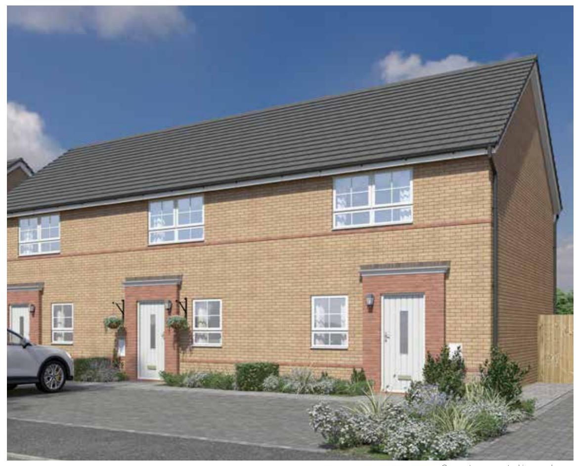
Computer generated image shown.