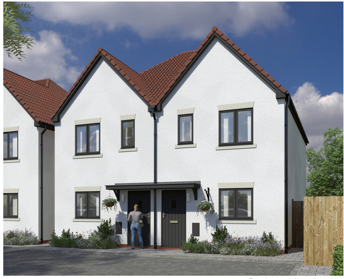
Computer generated image shown above.