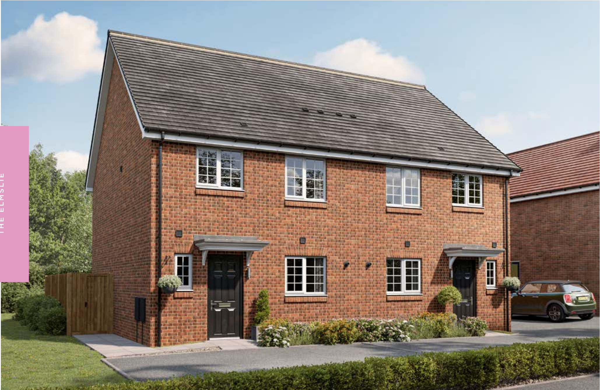
This image is from an imaginary viewpoint within an open space area. Its purpose is to give a feel for the development, not an accurate description of each property. The illustration shows a typical Platform Home Ownership home of this type, but there are, however, variances from site to site. External materials, finishes, landscaping, windows and the position of garages, (where provided) may vary throughout the development. Properties may also be built handed (mirror image). Please ask for further details.