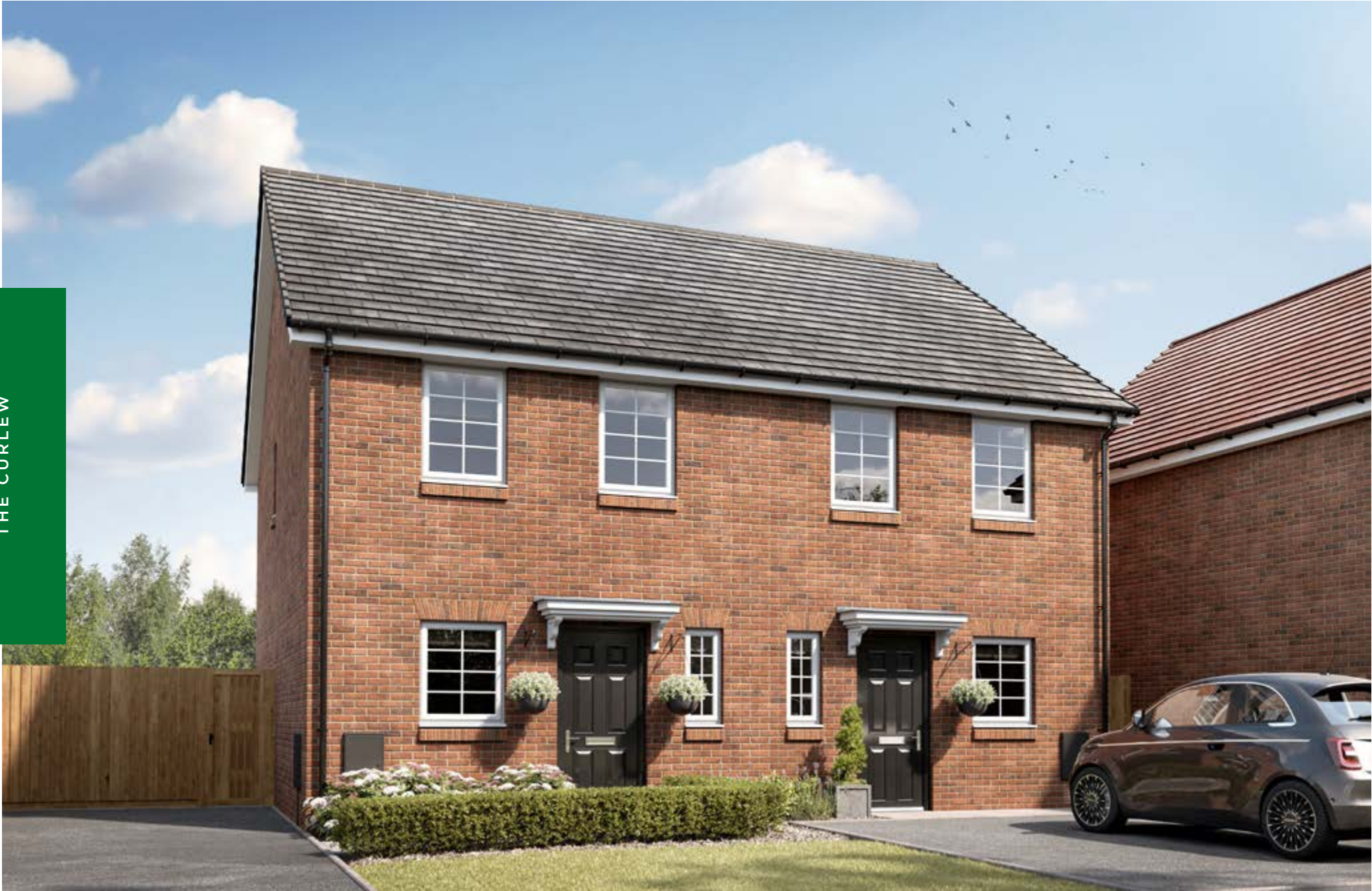
This image is from an imaginary viewpoint within an open space area. Its purpose is to give a feel for the development, not an accurate description of each property. The illustration shows a typical Platform Home Ownership home of this type, but there are, however, variances from site to site. External materials, finishes, landscaping, windows and the position of garages, (where provided) may vary throughout the development. Properties may also be built handed (mirror image). Please ask for further details.