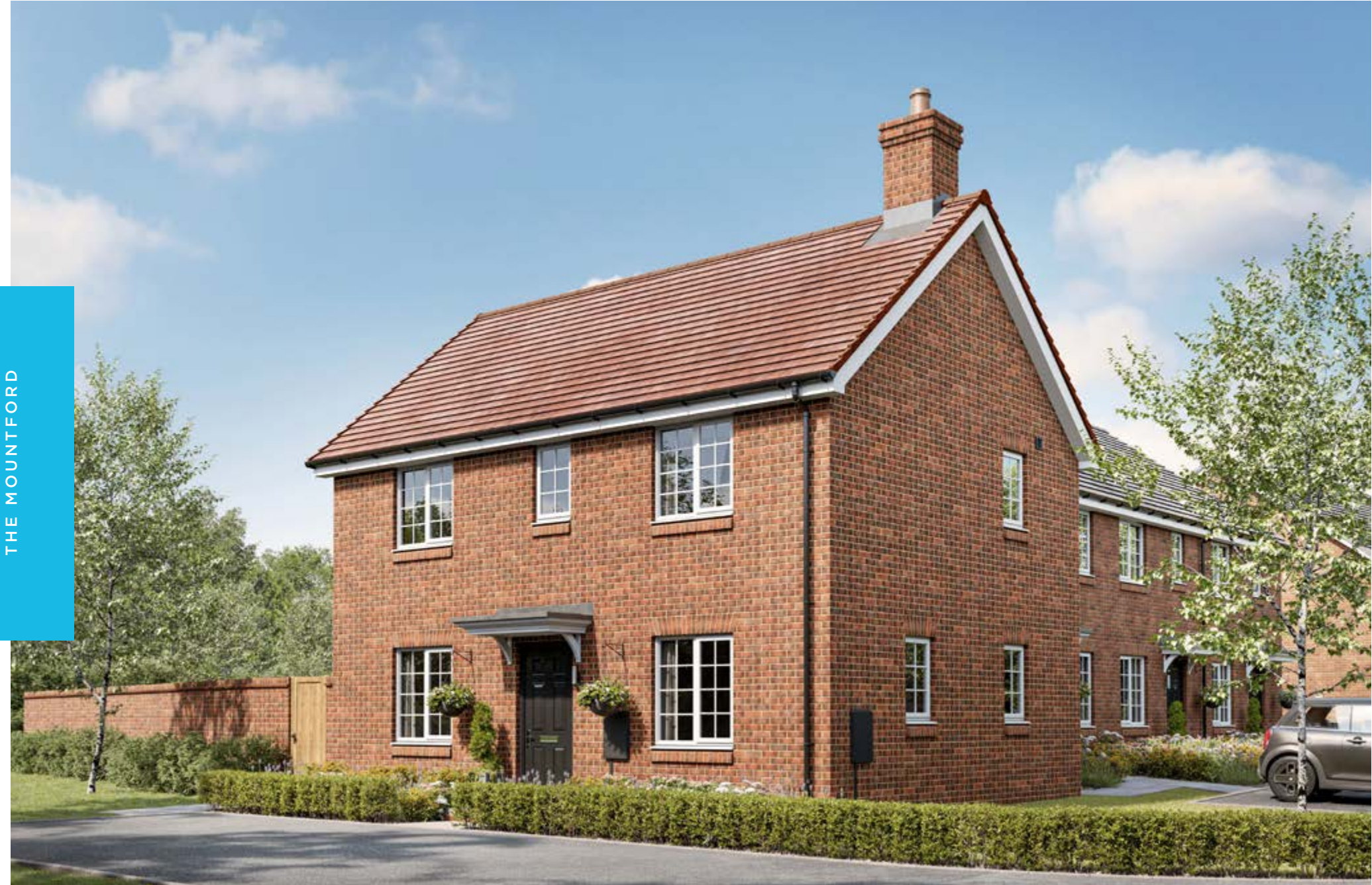
This image is from an imaginary viewpoint within an open space area. Its purpose is to give a feel for the development, not an accurate description of each property. The illustration shows a typical Platform Home Ownership home of this type, but there are, however, variances from site to site. External materials, finishes, landscaping, windows and the position of garages, (where provided) may vary throughout the development. Properties may also be built handed (mirror image). Please ask for further details.