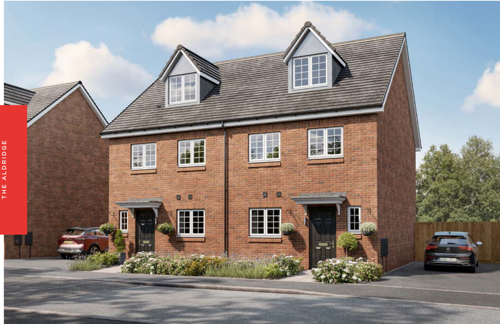
This image is from an imaginary viewpoint within an open space area. Its purpose is to give a feel for the development, not an accurate description of each property. The illustration shows a typical Platform Home Ownership home of this type, but there are, however, variances from site to site. External materials, finishes, landscaping, windows and the position of garages, (where provided) may vary throughout the development. Properties may also be built handed (mirror image). Please ask for further details.