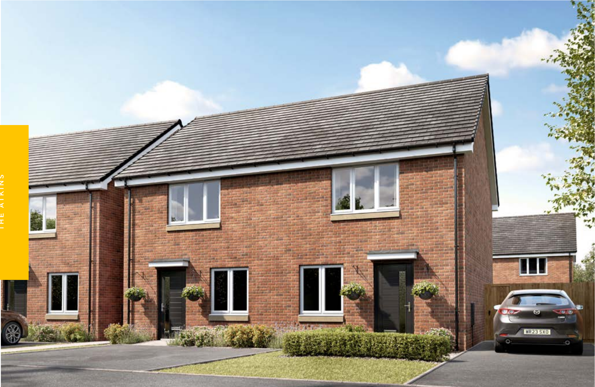
This image is from an imaginary viewpoint within an open space area. Its purpose is to give a feel for the development, not an accurate description of each property. The illustration shows a typical Platform Home Ownership home of this type, but there are, however, variances from site to site. External materials, finishes, landscaping, windows and the position of garages, (where provided) may vary throughout the development. Properties may also be built handed (mirror image). Please ask for further details.